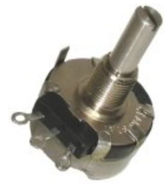
Representative photograph, actual product appearance may vary.

Due to regional agency approval requirements, some products may not be available in your area. Please contact your regional Honeywell office regarding your product of choice.