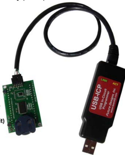
Example User Target Board (Not Part of Kit)

The ISP function uses only six pins: VCC, GND, RXD, TXD, PSEN- and RESET. The simple circuit above is all that must be added to the user’s application to use ISP with USB-ICP.